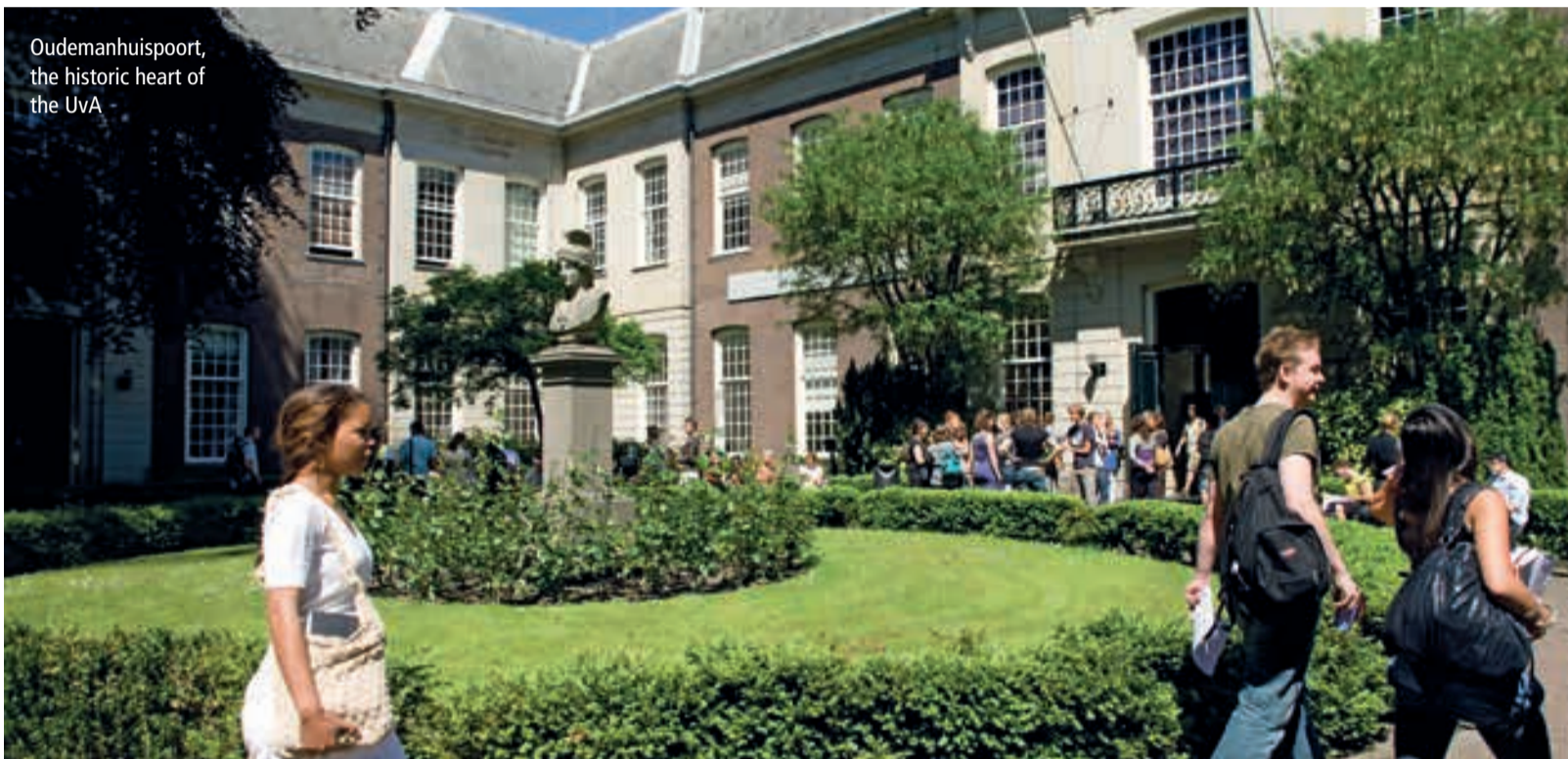
Oudemanhuispoort, the historic heart of the UvA