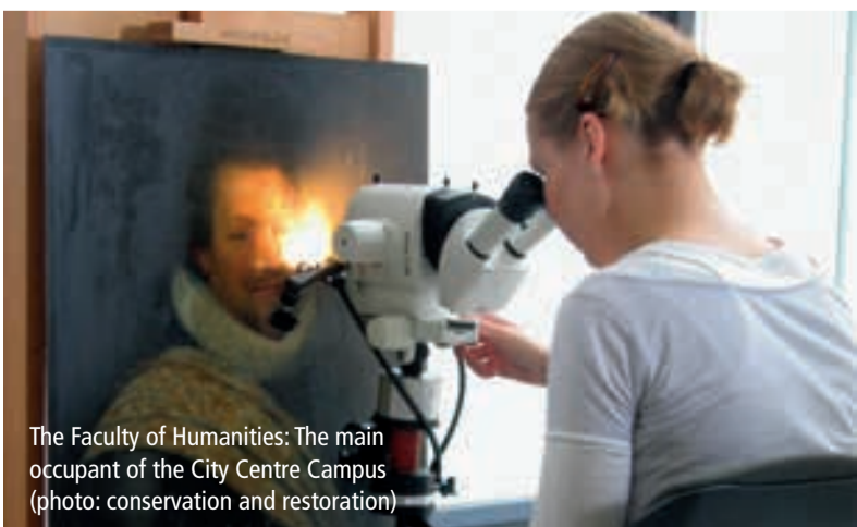
The Faculty of Humanities: The main occupant of the City Centre Campus